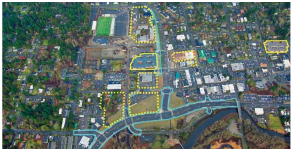
A 2015 aerial photo of built SR 522 and Phase I multiway boulevard improvements (blue outlines) with completed buildings (yellow outlines) and under-construction projects (yellow dashed outlines) entitled under Downtown Subarea Plan guidance.