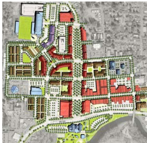
An illustration of the envisioned future downtown neighborhood. A new multiway Grand Boulevard (SR 527) helps to connect infill development and Bothell Landing along the river with Main Street and a new Civic Center.

FTB: When this project was completed the firm name was Freedman Tung & Bottomley (FTB).