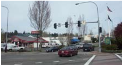
Main Street's entry as seen from strip-like SR 522 in 2009.