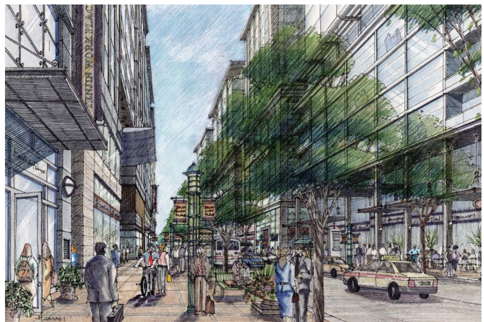
Envisioned Future of Meiji-dori: Envisioned integration of street-level shopfront, streetscape improvements and enhanced spatial enclosure on Meiji-dori.

IN COLLABORATION WITH: Kei Minohara Planning Office, Nikken Sekkei