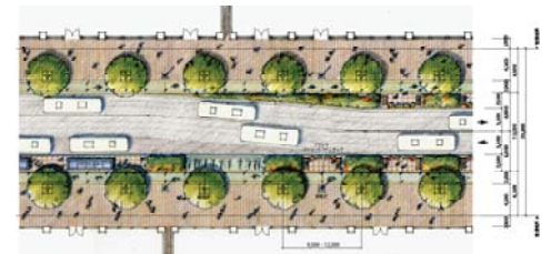
Meiji-dori Streetscape: Long-term transformation of Meiji-dori streetscape into a "complete street" featuring a bus transit mall, wider sidewalks, bicycle lanes and pedestrian pockets.