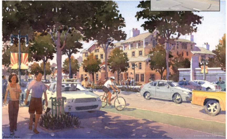
View of a San Mateo example of potential corridor transformation: a 1 story "strip retail" site (inset) is infilled with horizontal mixed use - a 4 story apartment building next to compatible corridor retail, set in a residential boulevard streetscape.