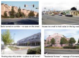
Examples of "unconvincing" corridor housing types.