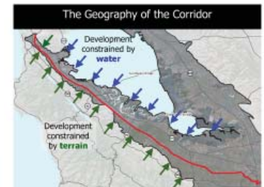
Above: An illustration of El Camino Real's role as a focal "spine" of movement and activity constrained by slopes and water on the Peninsula.

Below: A diagram of how the corridor functions as a series of "convenience segments" of most people's daily non-commute trips along the corridor occurring within 6-10 miles.