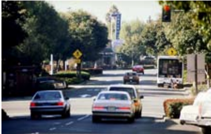
B Street view of BART surface parking lot site and adjacent properties that were identified for redevelopment