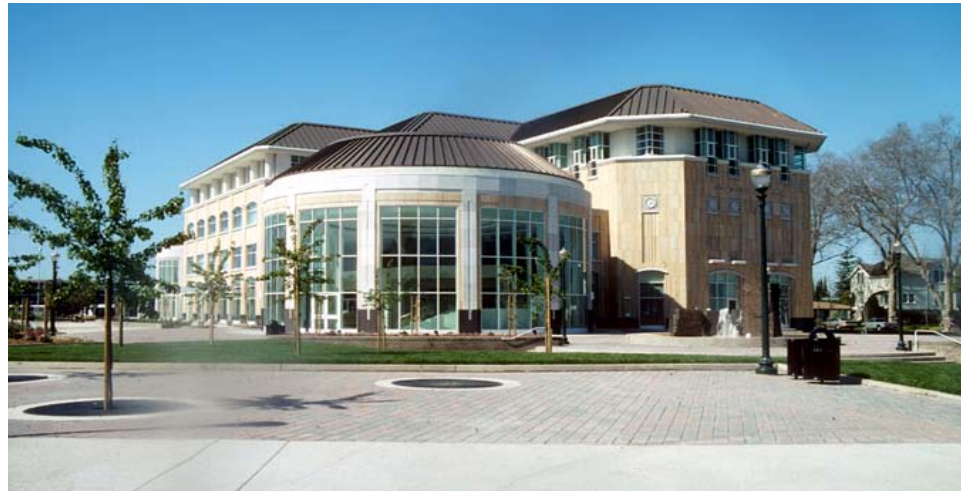
View of completed Hayward City Hall building (1998)

FTB: When this project was completed the firm name was Freedman Tung & Bottomley (FTB).