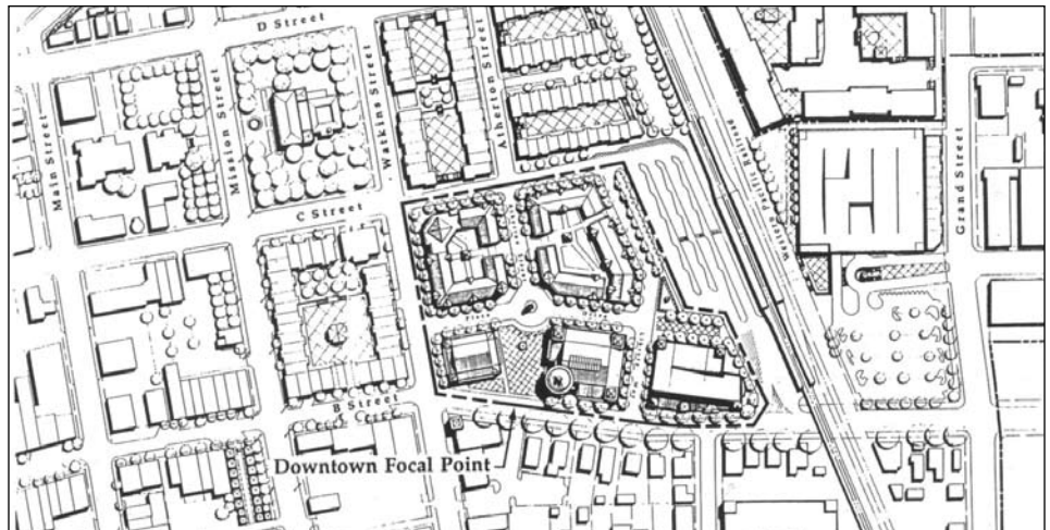
Plan view of downtown Hayward master plan site: existing and planned Downtown Plan development