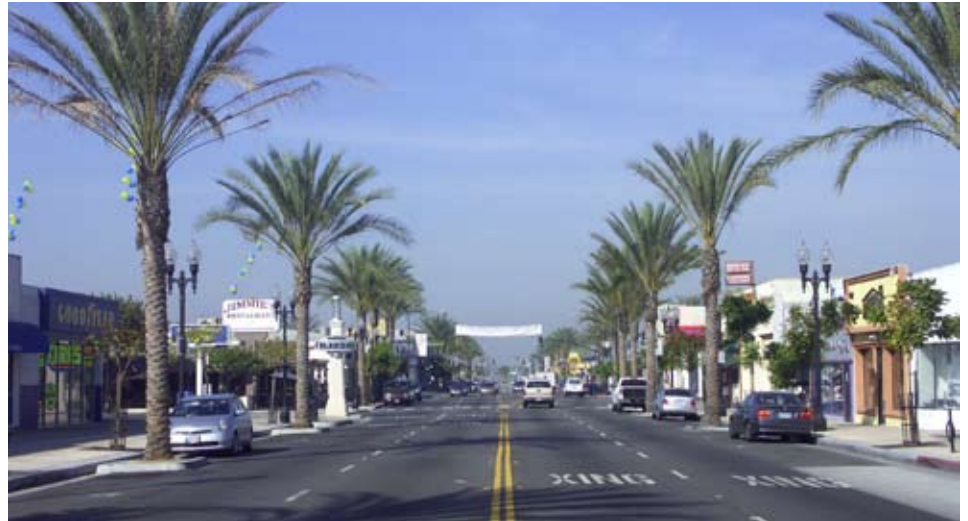
View of completed streetscape and landmark improvements. Trees and streetlights are located and sized to visually "narrow" the wide arterial road, strengthen boulevard character, and enhance pedestrian comfort.

East-west Whittier Boulevard traverses two miles through the center of Montebello, connecting it to neighboring East Los Angeles and Pico Rivera. Freeways, shopping malls, economic decline, single-use zoning and damage from the 1971 earthquake sapped the vitality from the corridor and its downtown portion. FTB was selected to prepare a Specific Plan and subsequent streetscape improvement project. Through a public workshop process, the Plan envisioned the revitalization of Whittier Boulevard through policy changes and design improvements that define and support mixed-use residential and downtown segments along the corridor and restore it as a vital heart of the City.