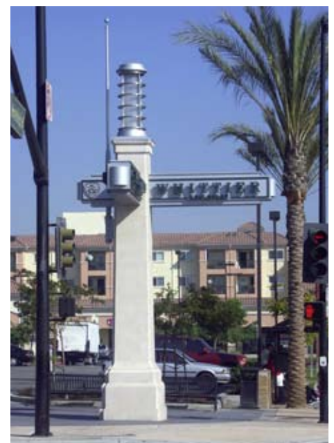
Distinctive entry sign features announce gateway locations at the east and west ends of the Whittier Boulevard corridor. Related crossings landmark marks the intersection of Whittier and Montebello Boulevards.