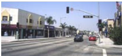
Whittier Boulevard Before Streetscape Improvements.