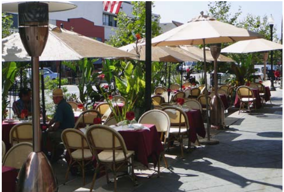
Outdoor dining in the Flexible Zone.