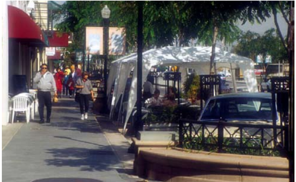
Castro Street features new "Flexible Zones" that can be used for either curbside parking or outdoor dining.

FTB: When this project was completed the firm name was Freedman Tung & Bottomley (FTB).