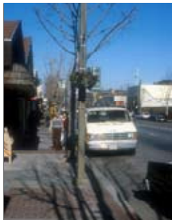
Castro Street was wide and auto-oriented prior to reconstruction