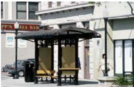
Bus Shelters designed as "civic umbrellas" accommodating shelter, seats, and lean rails while contributing to the identity of the street.