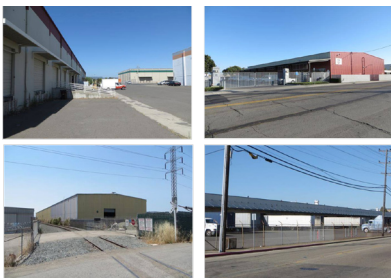
Storage-dominated district use and place character.