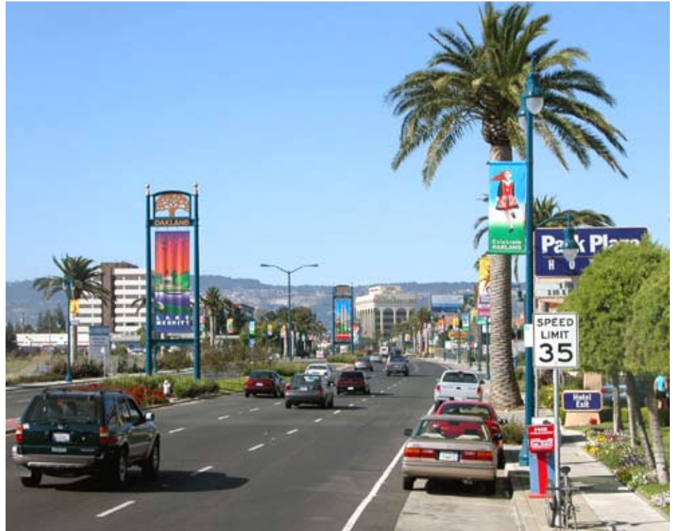
AFTER: Hegenberger Drive's “grand boulevard” streetscape and sign towers improved settings for hotels and traveler services.