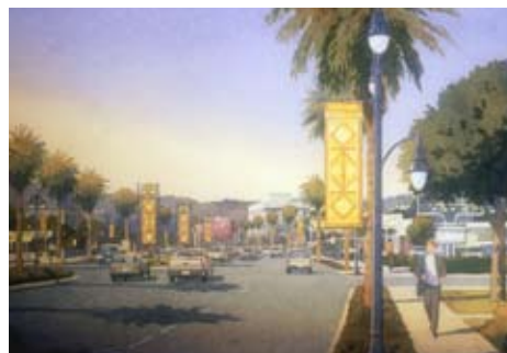
Rendering of the streetscape design concept for the Hegenberger Drive airport gateway corridor.