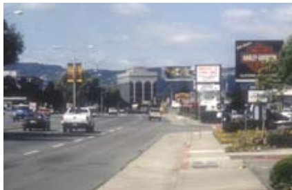
BEFORE: Hegenberger Drive was a placeless and anonymous commercial and industrial strip.