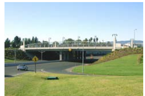
An arched railing framed by light columns at a new overpass above 98th Avenue creates a gateway effect near the airport.