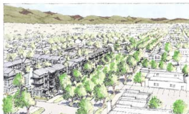
An illustration of a “strip commercial” corridor transformed into a grand, mixed-use Gateway Boulevard.