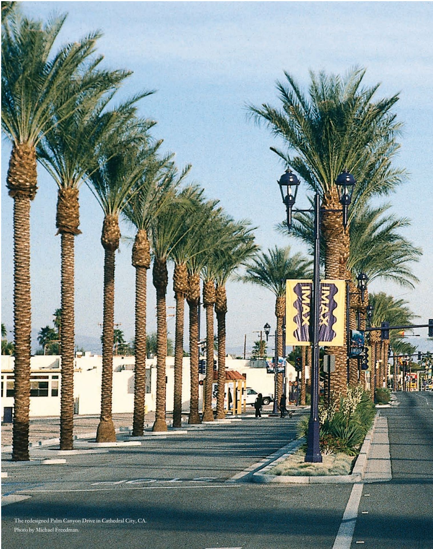
The redesigned Palm Canyon Drive in Cathedral City, CA.