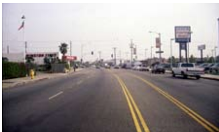
View of pre-existing "strip corridor"