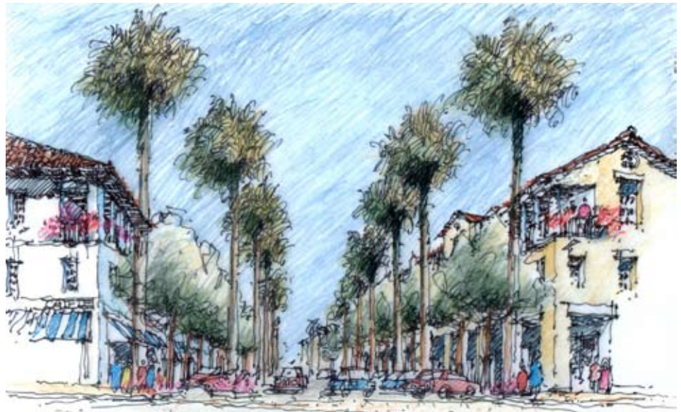
Perspective view by FTB of envisioned corridor with mixed-use development and supportive streetscape

FTB: When this project was completed the firm name was Freedman Tung & Bottomley (FTB).