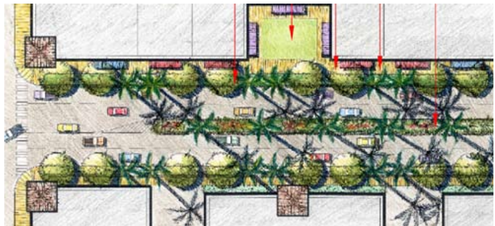
Corridor diagram showing land uses, character districts, and sub-districts