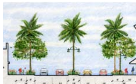
Illustrations showing streetscape recommendations