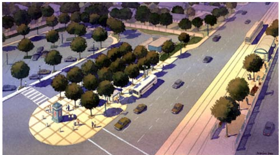
Rendering of recommended urban design concept for Berryessa Transit Center and Park and Ride Lot

CLIENT: Santa Clara Valley Transit Authority