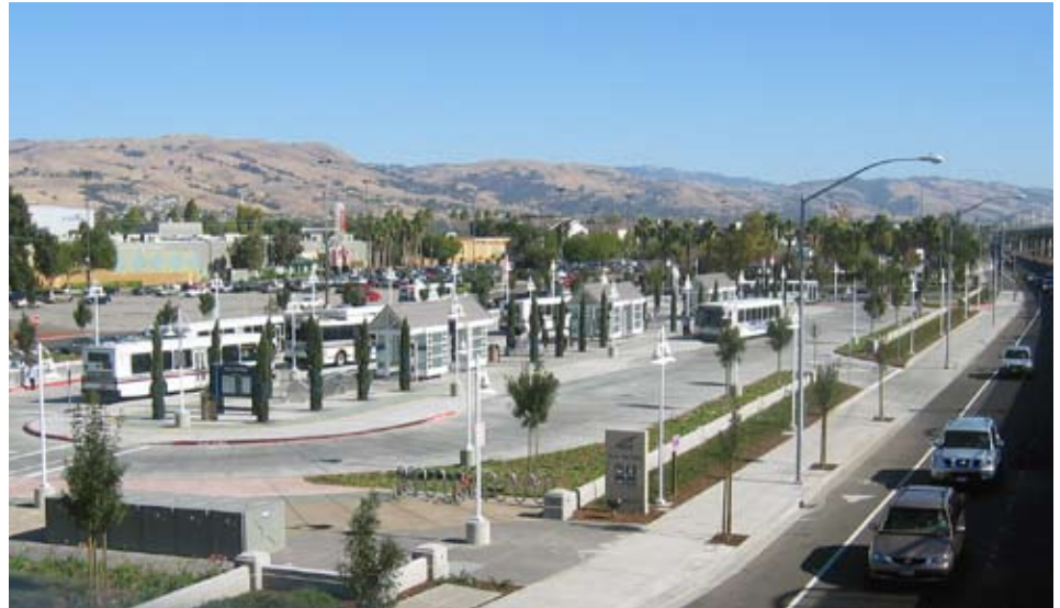
Completed Great Mall Bus Transfer Station (by others). FTB's design guidelines for bus island plan layout and pedestrian sequence, streetlight type recommendations, and border wall treatments were implemented in the design