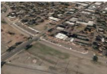
The "Bow-Tie" – an abandoned rail yard at the southern edge of downtown – is both an opportunity and a redevelopment challenge.