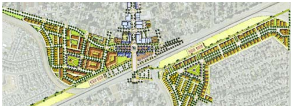
The proposed long term master plan for the Bow-Tie area consists of a new transit-oriented downtown neighborhood linked to the core shopping district by a central gathering plaza.