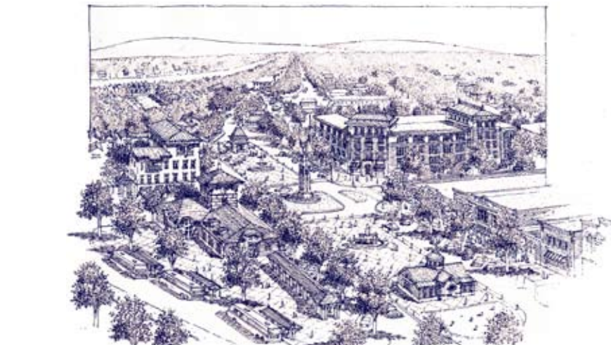
Bird's-eye view of proposed central gathering plaza, multimodal transit center, and new and existing historic buildings in the "Bow-Tie" area.

FTB: When this project was completed the firm name was Freedman Tung & Bottomley (FTB).