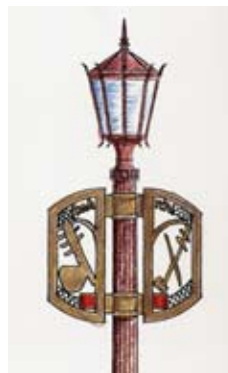
Left: Detail view of concept streetlight with thematic culture panels (Southeast Asian instruments shown).