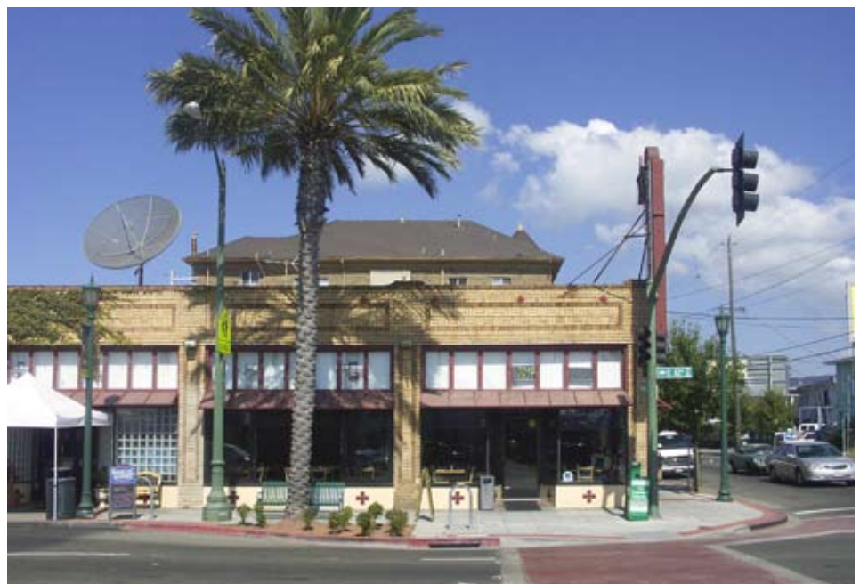
View of new palm tree, colored crosswalk paving, sidewalk corner bulb-out, pedestrian lighting, and streetscape furnishings.