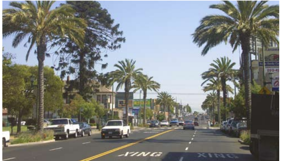
View south on East 12th Street after construction of project improvements including mature palm trees set within parking lanes.

FTB: When this project was completed the firm name was Freedman Tung & Bottomley (FTB).