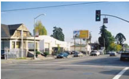
Typical conditions on East 12th Street before the project.