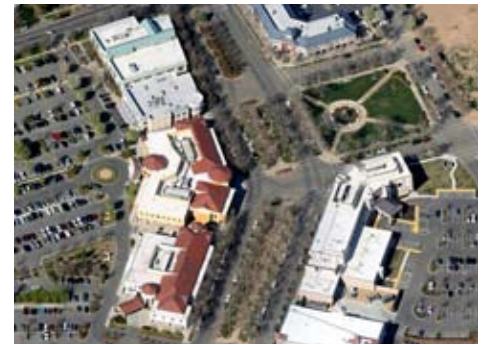
Aerial view of the town square, boulevard and medical office buildings that create place and address value together.