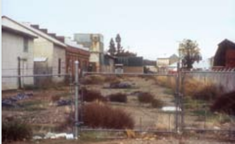
BEFORE: A disused rail right-of-way within the cannery site became the alignment for the new workplace boulevard.