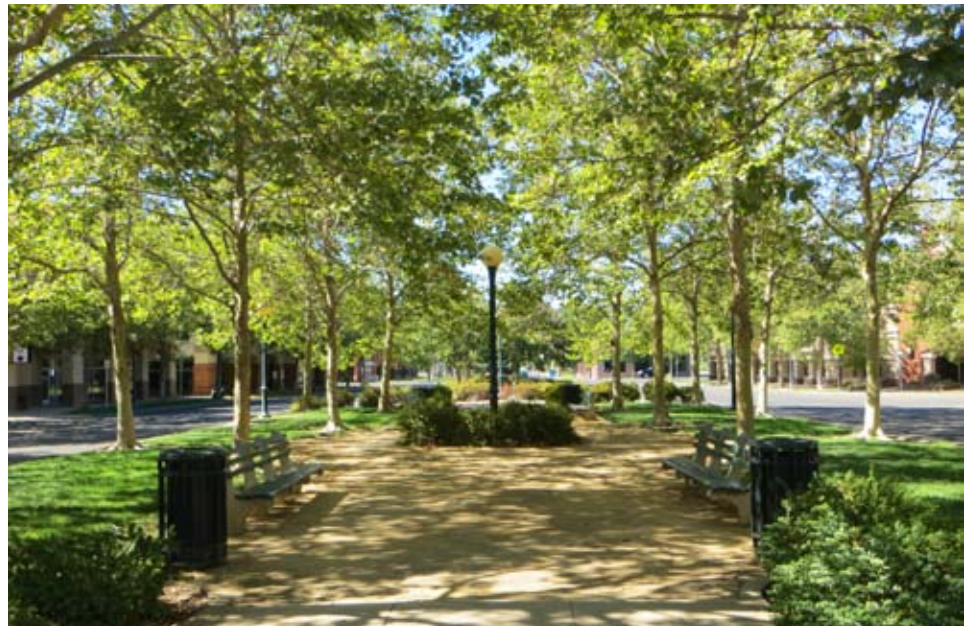
Plumas Boulevard's central landscaped median contains a park promenade path between four rows of trees and attracts many strollers and runners. Medical office buildings line the boulevard with shaded arcades and more parkway trees.