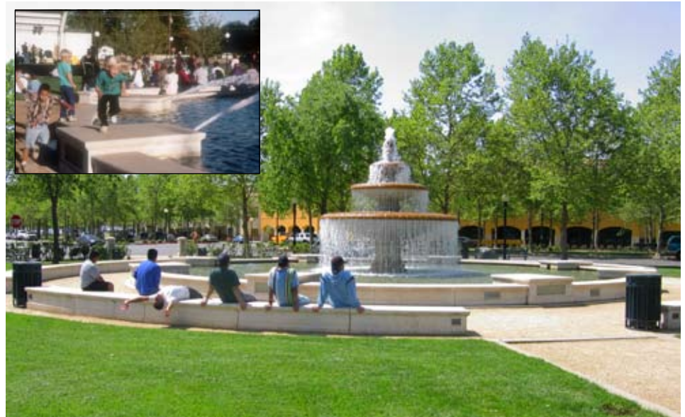
AFTER: The Town Square is a popular setting for the weekly farmers' market and community festivals as well as an everyday green space for district workers, downtown shoppers and nearby residents. Inset: children enjoying the central fountain.